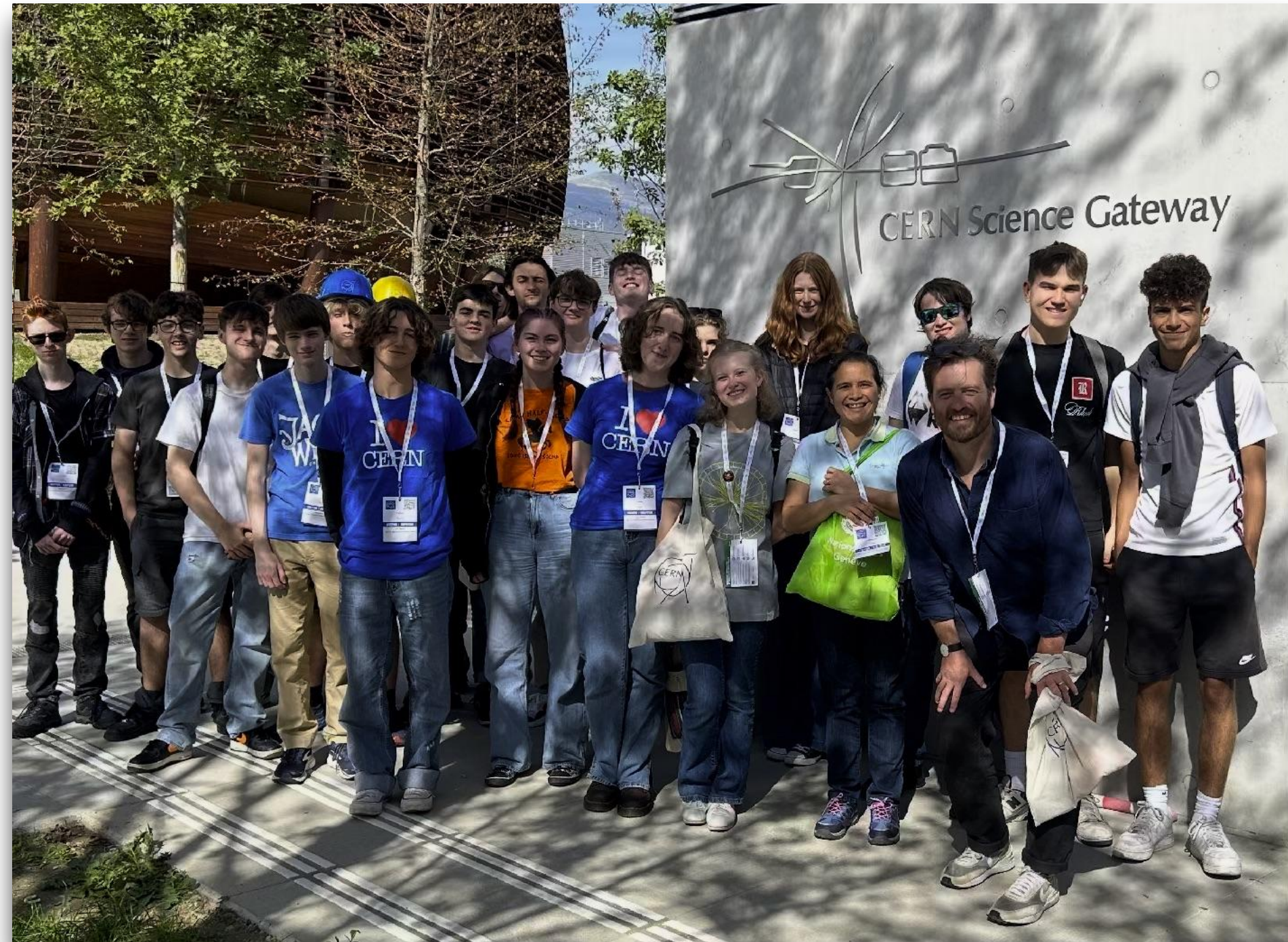
A level Science trip to CERN