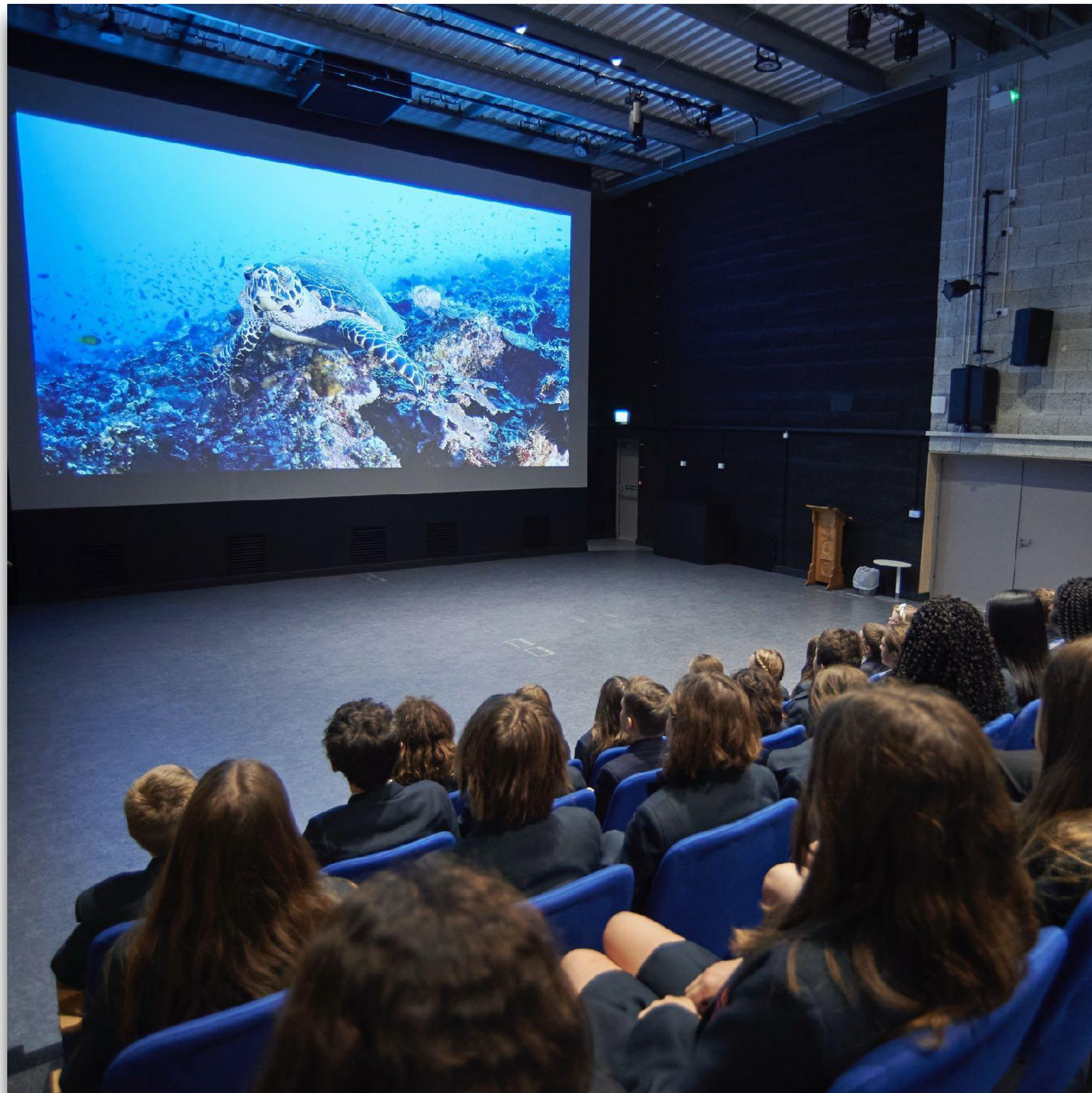
School Theatre 2021