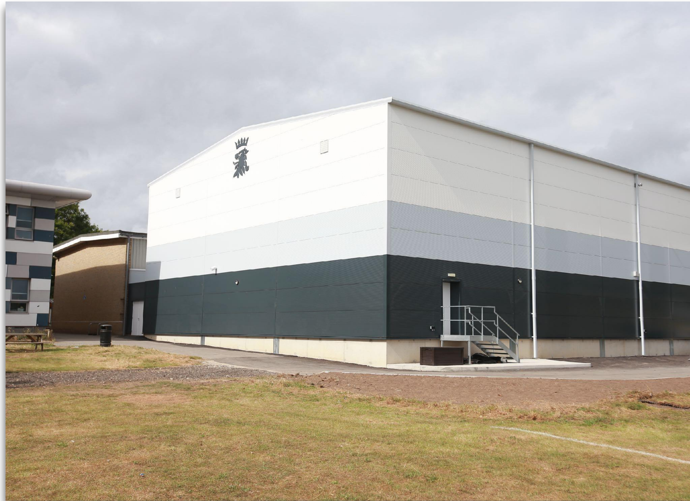
Sports Hall 2023