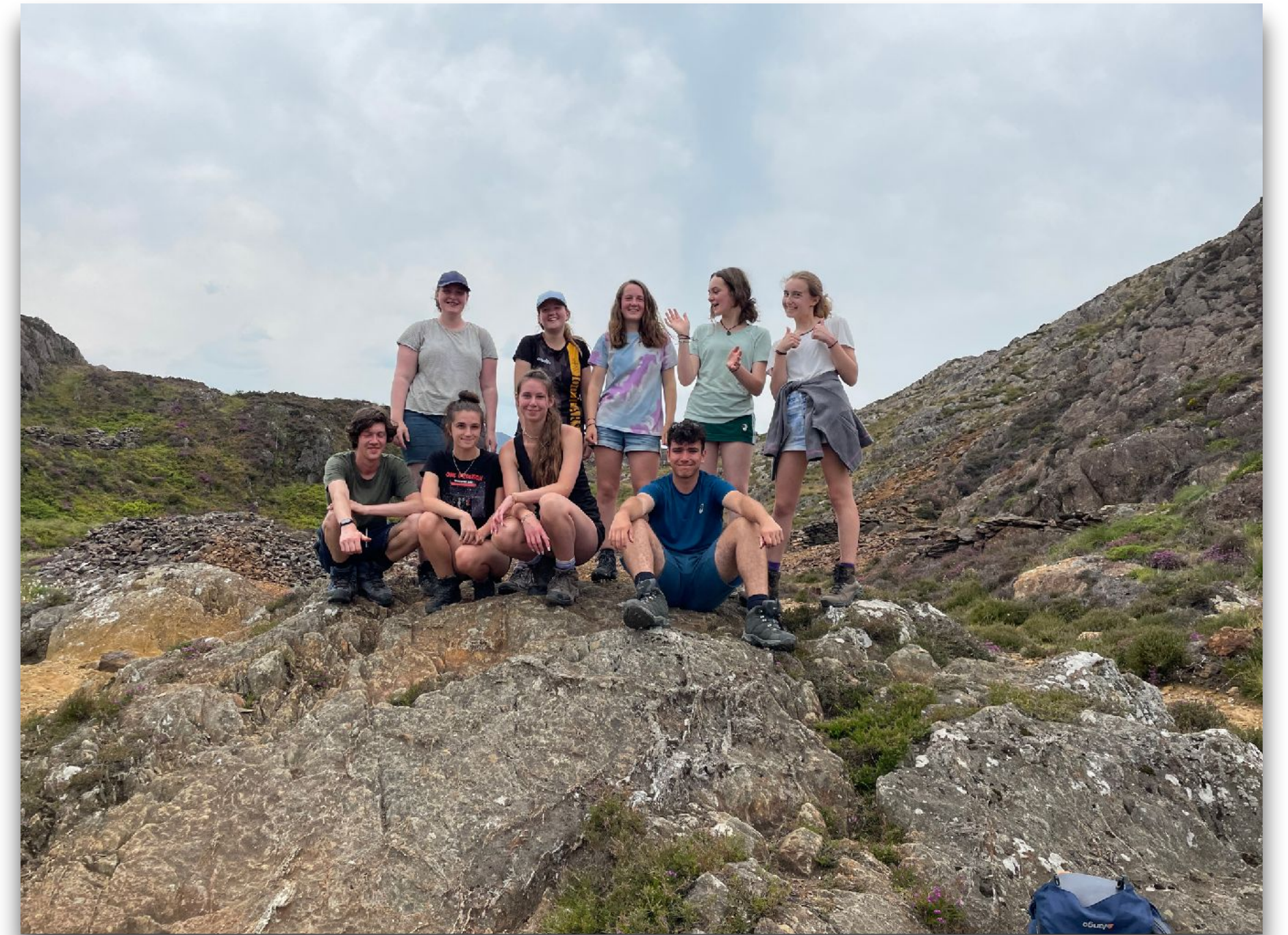
Gold Duke of Edinburgh's Award expedition

Students, including those in the sixth form, benefit from an extensive range of trips and enrichment experiences. Opportunities such as collaborating in scientific research with the European Space Agency or running science and technology workshops for local primary school children help to prepare pupils to be responsible citizens. Ofsted