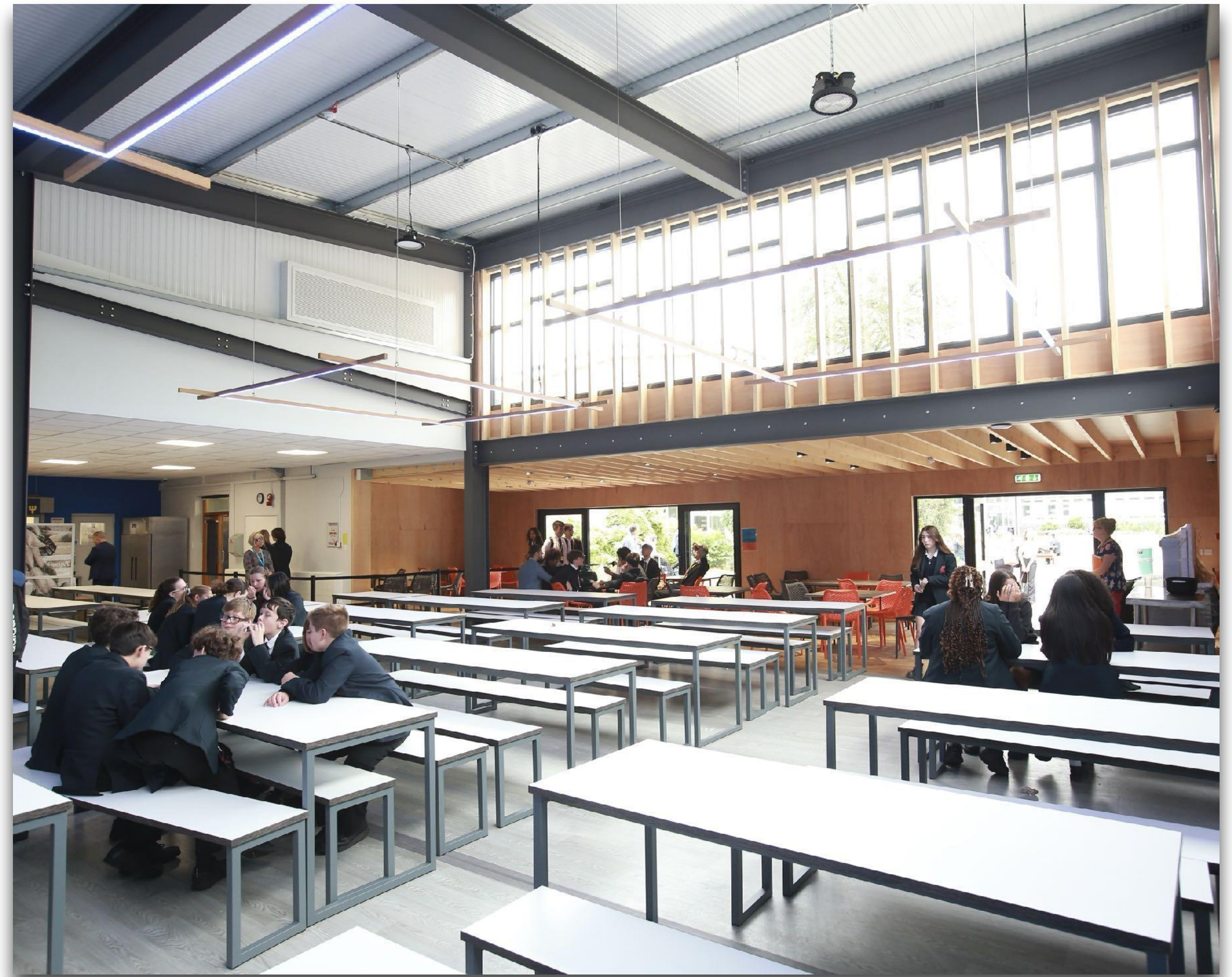
Dining Hall 2023