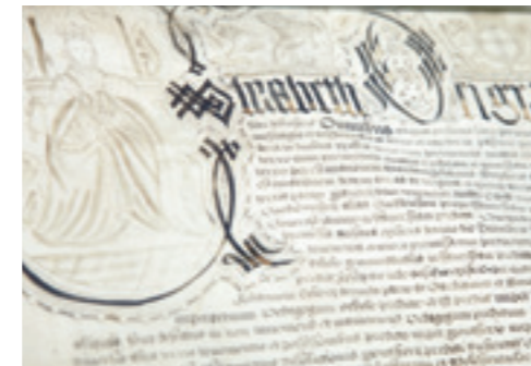
The Royal Charter and Seal of Queen Elizabeth I

The modern school dates back to 1967 when the school began to teach girls and boys together on the present site, following the merger of The Faversham Grammar School with The William Gibbs School for Girls. The first co-educational selective school and one of the most popular schools in Kent, Queen Elizabeth's has a rich and vibrant history.